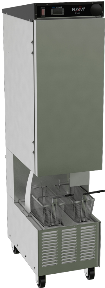
Fryer Baskets Sold Separately

Operation of the R160 Frozen Food Dispenser is easily controlled by a power switch, simple visual portion control and an ergonomic basket fill location.