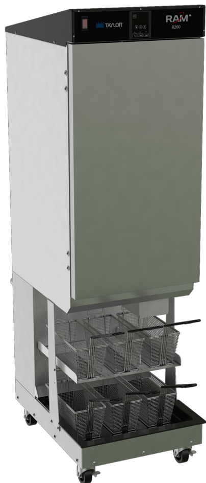
Fryer Baskets Sold Separately

Operation of the R200 Frozen Food Dispenser is easily controlled by a power switch, portion control keys and a series of menu functions located on the operator control panel. The LED control display is used for calibration, and system diagnostics. The portion control keys are used to select the desired basket load weight and will alert crew when the hopper is empty.